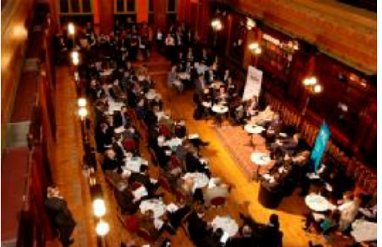
Participants at the Bibliothèque Solvay