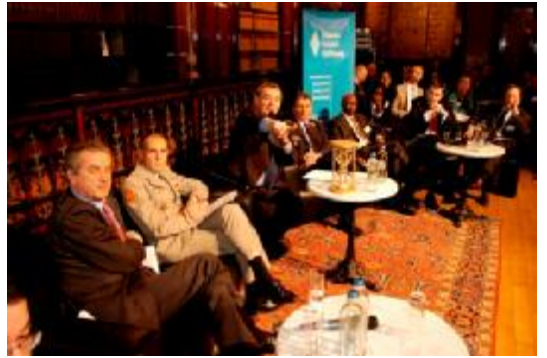
Speakers during the panel debate