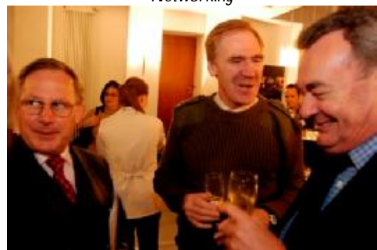
New insights during cocktail