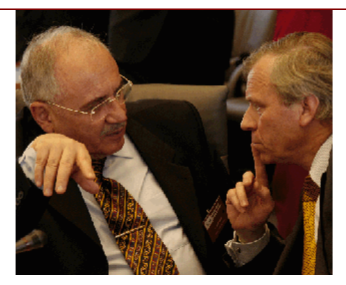
Vecdi Gönül and Jaap de Hoop Scheffer

BUILDING ON THE COMBINED EXPERTISE AND AUTHORITY OF THOSE INVOLVED IN OUR MEETINGS, THE SDA GIVES GREATER PROMINENCE TO THE COMPLEX QUESTIONS OF HOW EU AND NATO POLICIES CAN COMPLEMENT ONE ANOTHER, AND HOW TRANSATLANTIC CHALLENGES SUCH AS TERRORISM AND WEAPONS OF MASS DESTRUCTION CAN BE MET.