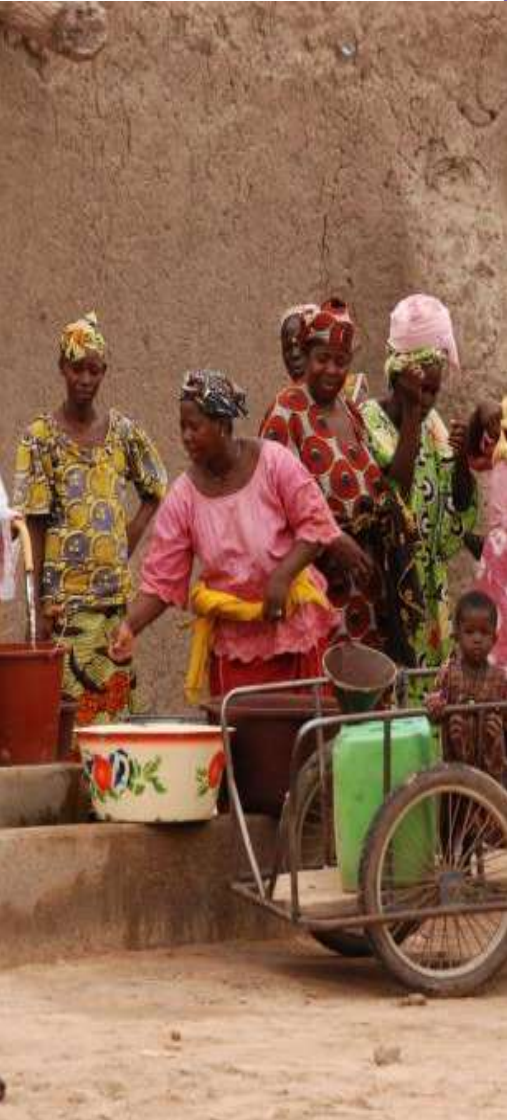
Women collecting water - Mali