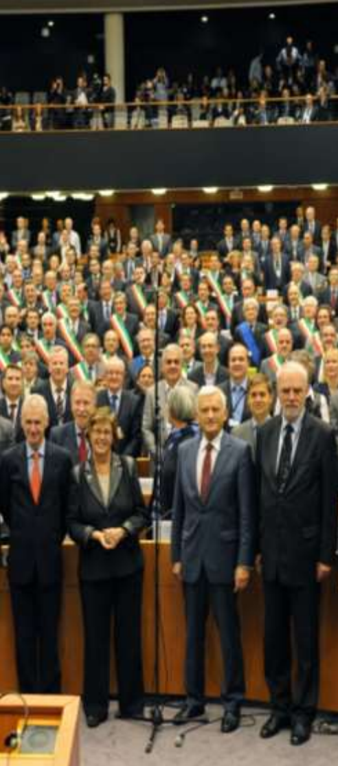
Mayors of the Covenant in the European Parliament, 2009